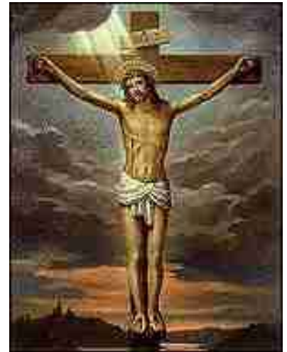
The Cross of Christ is the ultimate symbol of love and brings unity.

Whew! I know this is a lot of information but I believe that the Holy Spirit wanted all three articles to be shared with you. Again, I say thank you, Jesus, for allowing me to be living in “such a time as this.” Esther 4:14