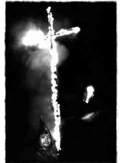
The Ku Klux Klan tried to high-jack the cross and make it a symbol of hate and prejudice and disunity.